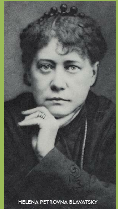
Helena Petrovna Von Hahn

When walking in London in 1851, she saw a tall and stately Rajput whom she recognised as a Protector known in her visions from childhood. He spoke to her of a future work she was to do under His direction after preparation in the East. In 1852-54 she attempted to enter Tibet; however she was not successful until 1867-70. During the intervening period, she made contact with spiritualism, learned to 'bring under her control her marvellous power to produce phenomena at will,' In Tibet, she learned, we are told, to manipulate occult forces. In Cairo in 1871 she made an unsuccessful attempt to found a spiritual society upon the basis of phenomena. HPB referred to an ancient Fraternity of Adepts or 'Brothers'. It exists as a perennial source for the preserving and recording of the events and facts of the history of religions and philosophical evolution in the world. The Theosophical Movement is declared to be Their inspiration, and HPB claimed only to be their "agent-messenger" and their student. Whilst in Paris she received peremptory 'orders' from 'the Brothers' to go to New York to await instructions. She landed on 7 July 1873. In 1875 she co-founded the Theosophical Society in New York.