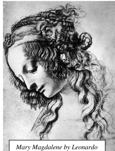
Mary Magdalene by Leonardo